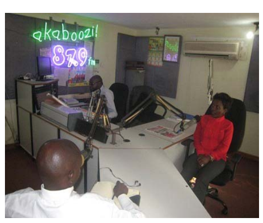
MPADV team in a radio talk show on Akaboozi Ku bbiri

MPADV developed a media strategy that intends to work towards the fulfilment of its objective to raise the profile of MPADV in Uganda and make their challenges known by decision-makers and other stakeholders.