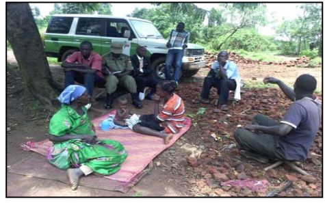
Family meeting at Kalagi Mukono district.

In MPADV outreaches there are also door to door family meetings. This works more in our clients families were