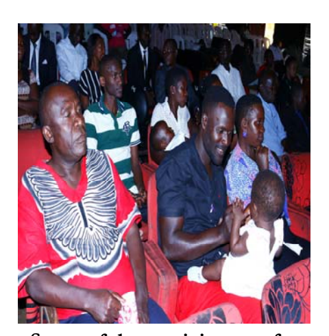
Some of the participants of Father's Day 2016

In order for MPADV to promote male involvement to become active parents and care givers, we work with fathers groups. Any man who is a father can voluntarily ioin, after mobilization and sensitization, later on form a group of 30 mem-MPADV trains them and sensitize them on the role of fathers in a family. The best performing fathers are rec-