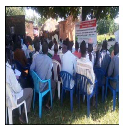
Community Dialogue meeting in Iganga Nakalama Sub-County

The financial year 2016-2017 has been fruitful for MPADV, almost 90% of the annual work plan has been achieved, include;