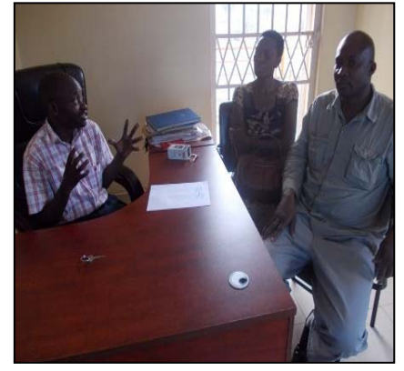
MPADV Staff during counseling Session

MPADV attended more than 104 men in a the year 2015-2016, 27 women who reported cases of their husband's family responsibility neg-