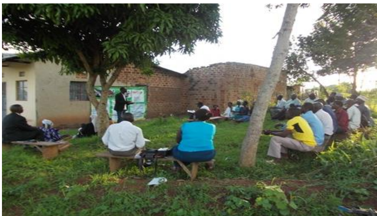
One of the community seminar which was carried out by MPADV. This was at Najjanankumbi Rubaga division in Kampala district