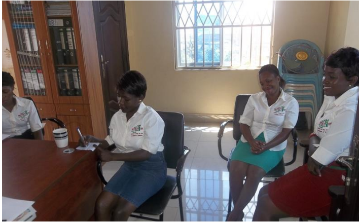
Some of the MPADV staff in a meeting at the secretariat

With the assistance of the Board members, MPADV managed to get a fully furnished office which works as MPADV secretariat is located in Najjanankumbi along Entebbe road at Nambi Irene House.