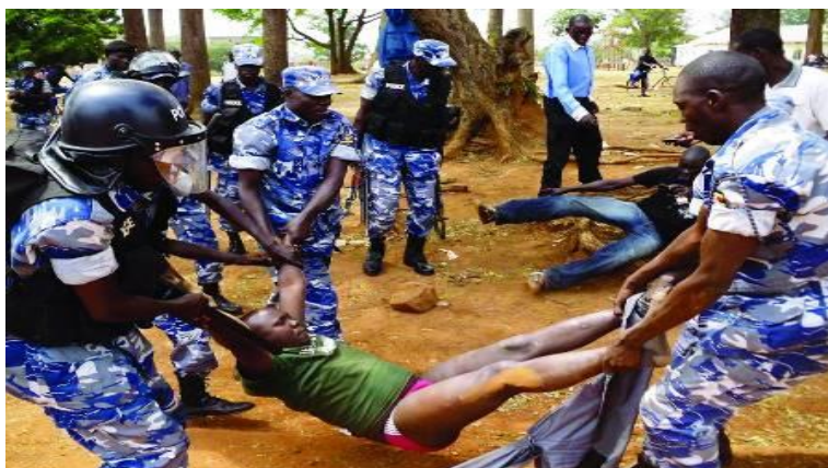
MPADV is against all forms of human rights violations .