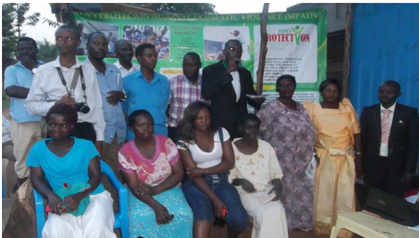
Some of the MPADV community activists of Kawempe division in Kampala district