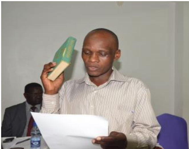
A Board member on a swearing in ceremony of MPADV Board of Directors which took place at Sojovalo Hotel Rubaga road in Kampala

After swearing- in, the Board members started playing a vital role in creating and maintaining viable work throughout Kampala district. Only close cooperation and coordination ensured the timely and effective information exchange and implementation of activities. MPADV therefore has continuously involved the Board of Directors in following-up, by regular updates on the current state of affairs, participation in the planning process and distribution of particular responsibilities.