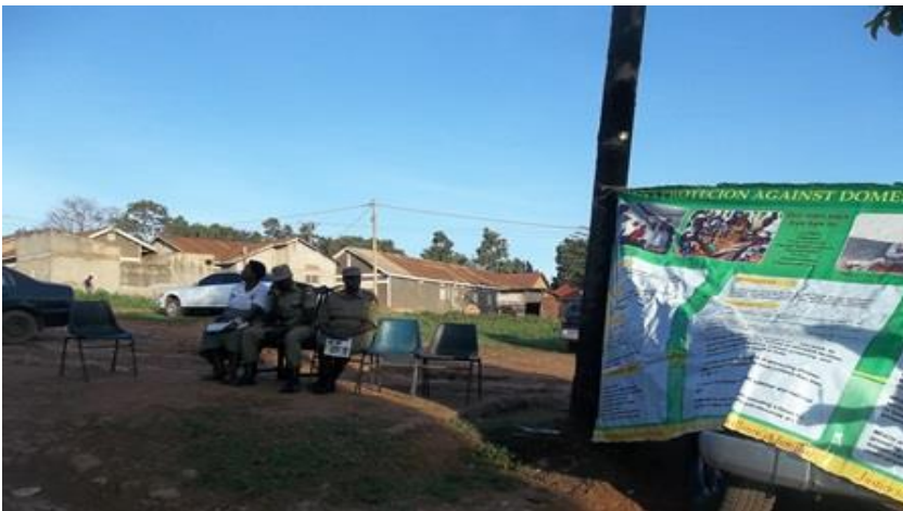
MPADV works hand in hand with the Police here they were at the MPADV seminar in Kanyanya Kawempe Division Kampala District

These activists work hand in hand with MPADV in order to spread the message of MPADV from the grass root.