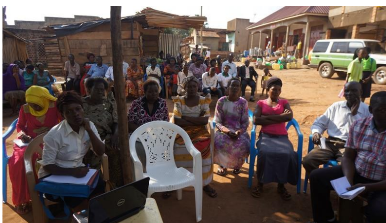
Some of the community members who attended a seminar in Kizito zone Rubaga division Kampala district