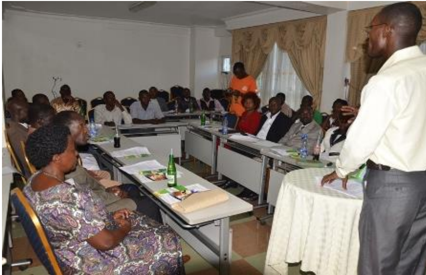
MPADV staff during a capacity building session at Sojovalo Hotel Rubaga road in Kampala.

In the long term, MPADV seeks to conduct national training workshops for men's rights defenders in each district that will not only enhance their capacity but will initiate the formation of district coalitions of men's rights defense. These coalitions are to act on the challenges faced at districts and feed into the secretariat of the organization. Having effectively organized district coalitions will increase the potential to strengthen intervention for the protection of men on national levels.