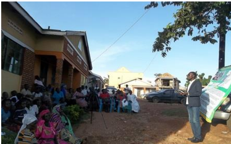
MPADV staff addressing community members of Nsooba zone in Kanyanya Kawempe division in Kampala district

MPADV has managed to conduct seminars to share information with community on domestic violence related issues, encouraging men to break the silence on domestic violence, empowering men to be responsible to their families, advocate for men's rights, Family planning campaigns, and campaign on HIV/AIDS etc.