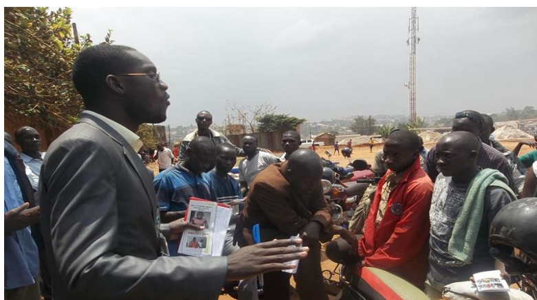
MPADV staff sharing information on domestic violence related issues with Bodaboda (Motorcycle) riders in Makindye division