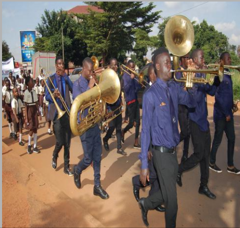
Matching from Shell Nakawa to the Venue