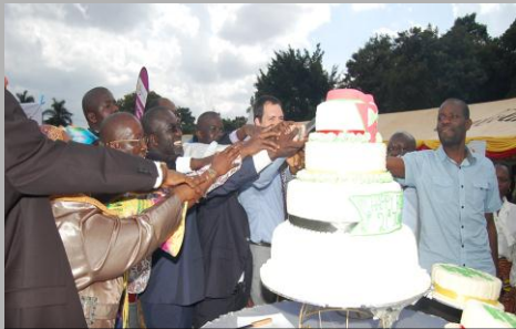
Cutting the cake